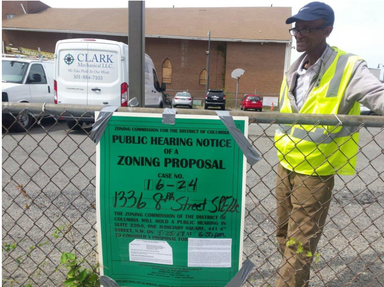
2. ZC 16-24 8th Street NW Posted 4-12-17