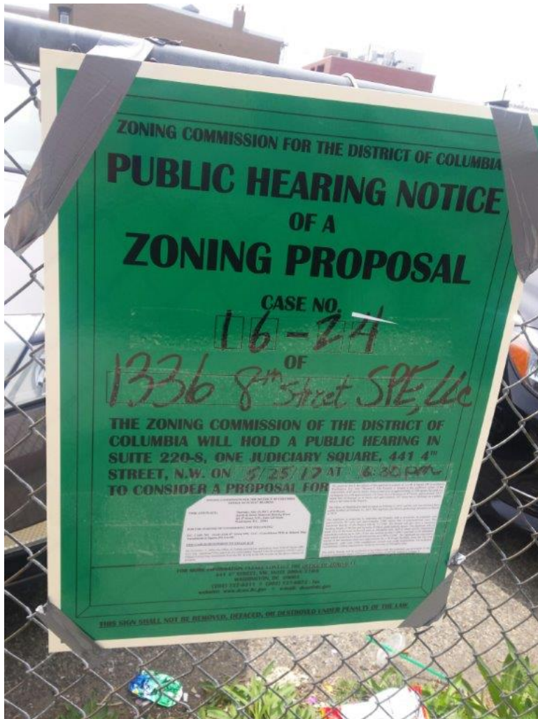
1. ZC 16-24 O Street NW Posted 4-12-17